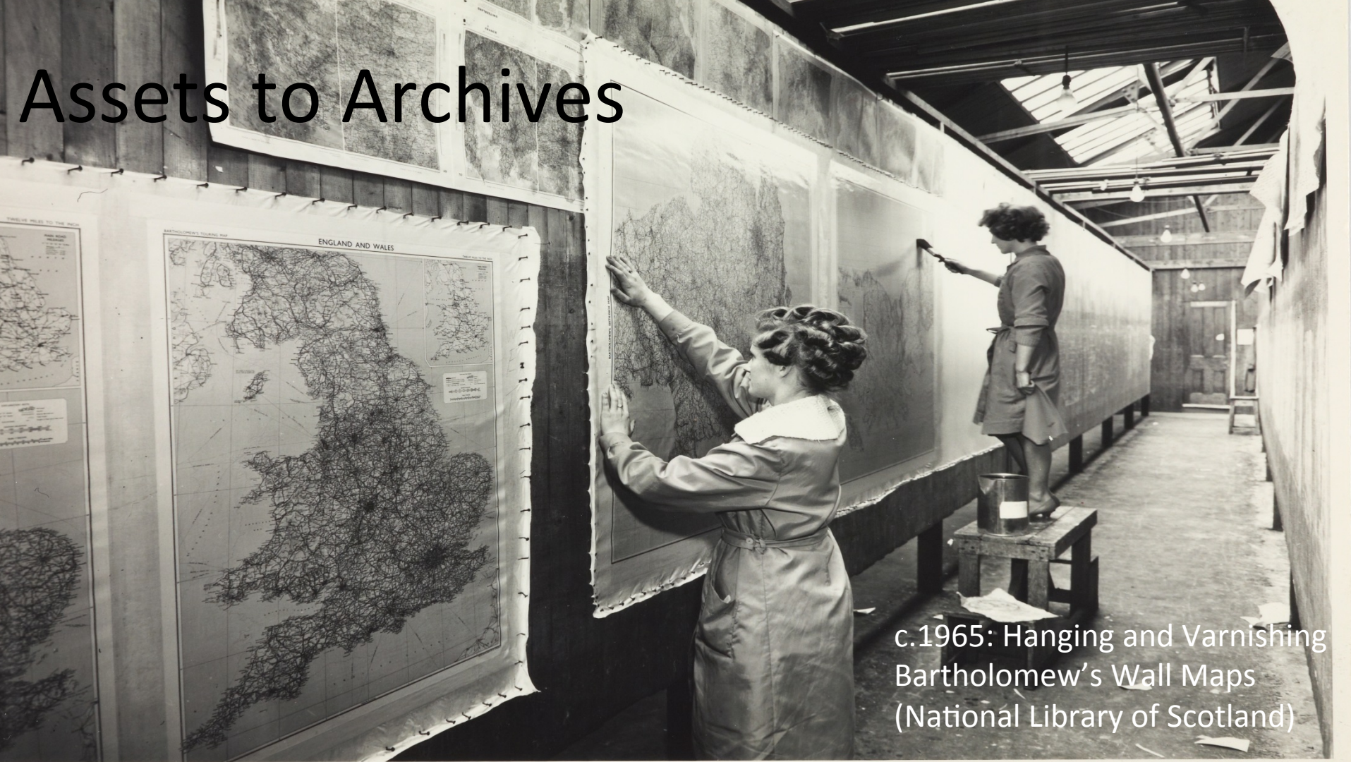
c.1965: Hanging and Varnishing Bartholomew's Wall Maps (National Library of Scotland)