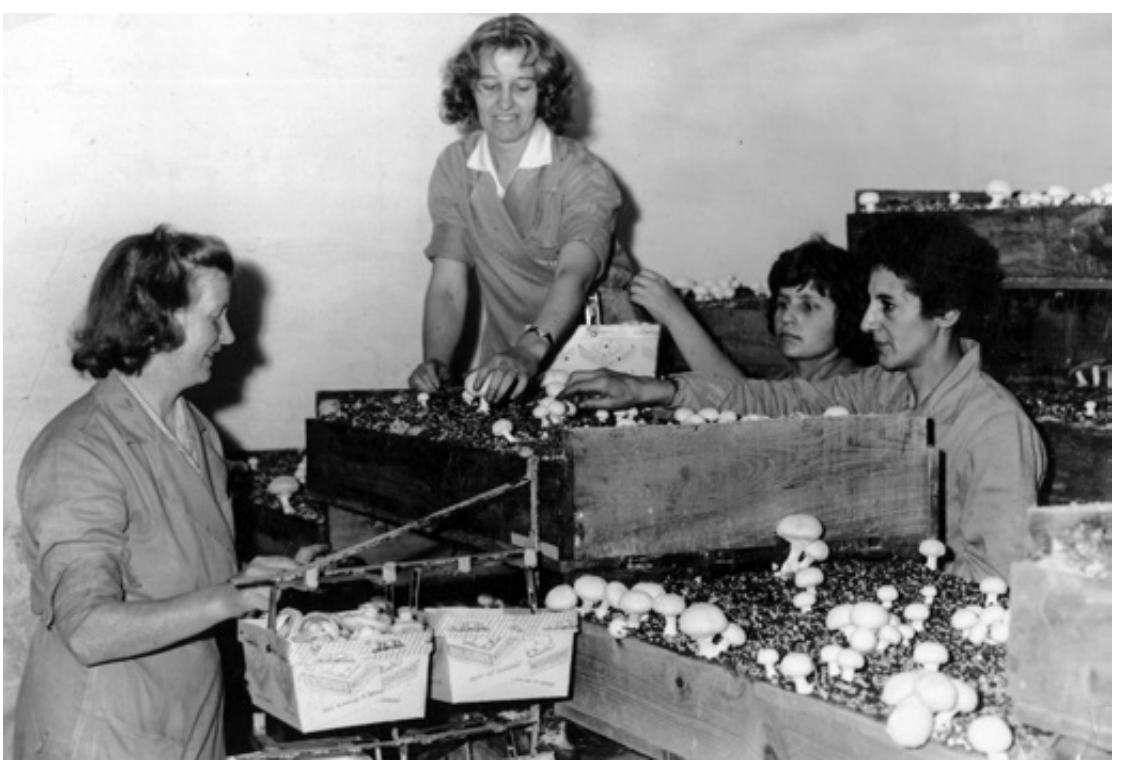
Women harvesting mushrooms at Sampson's mushroom farm, c1960s