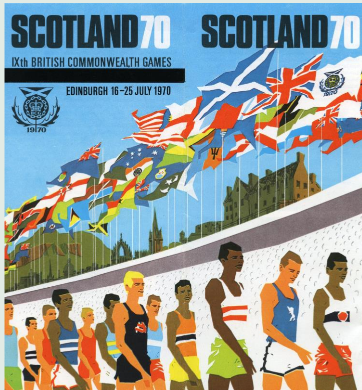
Poster for the IXth British Commonwealth Games

For the full programme and more details, please see the BRA's website at www.britishrecordsassociation.org.uk/events/annual-conference-26-november-2015