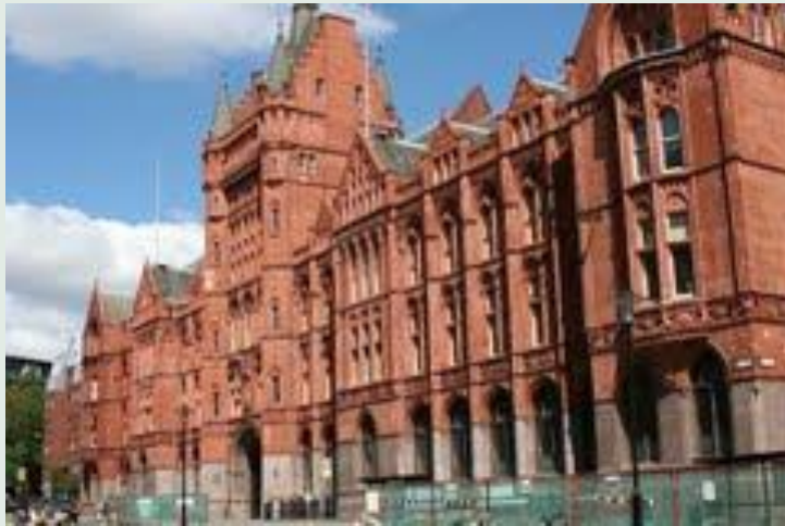
The Prudential Assurance Building, Holborn Bars

The conference is now fully booked but for those of you who are signed up, here is a reminder of what is in store for you.