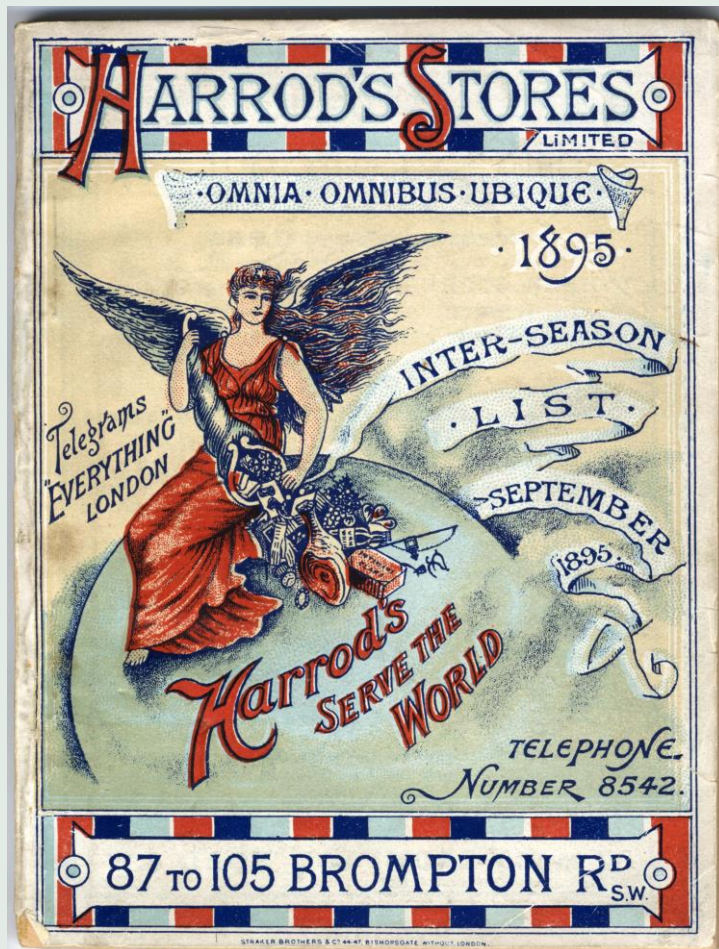
Harrod's Stores Price List, 1895

Walking down the Brompton Road, it is impossible to miss the terracotta palace that is Harrods! The Harrods Archive was established in 1989 and is home to records and artefacts dating from the last quarter of the 19th Century onwards. These document the fascinating progress of the company from its humble beginnings as a grocer's to the internationally renowned institution it is today.