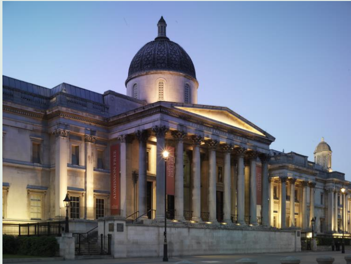
The National Gallery at night

The inspiration for the conference is to celebrate the National Gallery's acquisition of the Thos. Agnew & Sons art dealers business archive. The conference will be held 1-2 April 2016 at the National Gallery. Papers should be submitted by 18 September 2015.