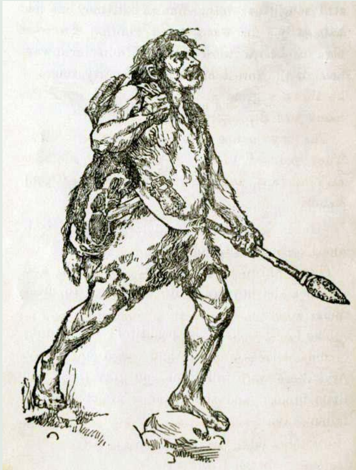
'The cave boy of the age of stone' by Margaret A. McIntyre

All those attending, whether they are archivists, depositors, historians or other users of archives, will be encouraged to think about and debate the implications of these different collecting activities for them. The day will include contributions from The Prudential, HSBC, Unilever, The National Archives, and the Business Archives Council of Scotland, with more to be confirmed in the coming days.