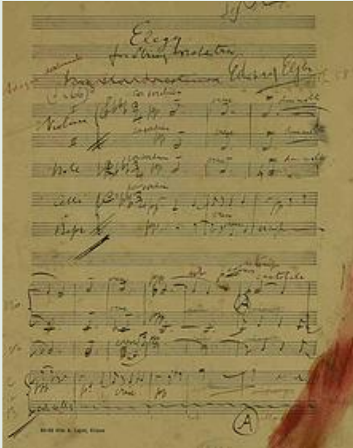
Sir Edward Elgar's 'Elegy' which was composed for the Musicians' Company in 1909

The Company Archives' new website includes digitised Court Minute books from 1772 – 1918, an extension to the 'ROLLCO' database (details of the Musicians' Company's apprentices and freemen), and images of many of the treasures and artefacts owned by the Musicians' Company, including original manuscript scores, letters and artworks.