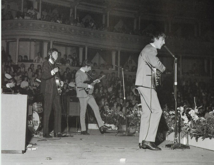
The Beatles performing at the Royal Albert Hall, 1963

This week the Royal Albert Hall launched its new website, which will amongst many other benefits tell the full story of the Hall through the opening up of its Archive to the public for the first time ever.