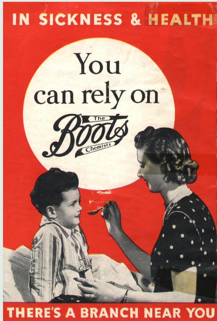
Boots advertisement, 1940

The Boots Archive is delighted to announce that it has recently been successful in securing a grant from The Wellcome Trust to increase accessibility to the collection, transforming it from a predominantly internally focussed service to an international academic resource. The grant was awarded through the Research Resources programme and will fund a five year project. A project Archivist will be appointed to enhance existing catalogue entries in line with ISAD (G) standards and an online version of the database will become available for the first time.