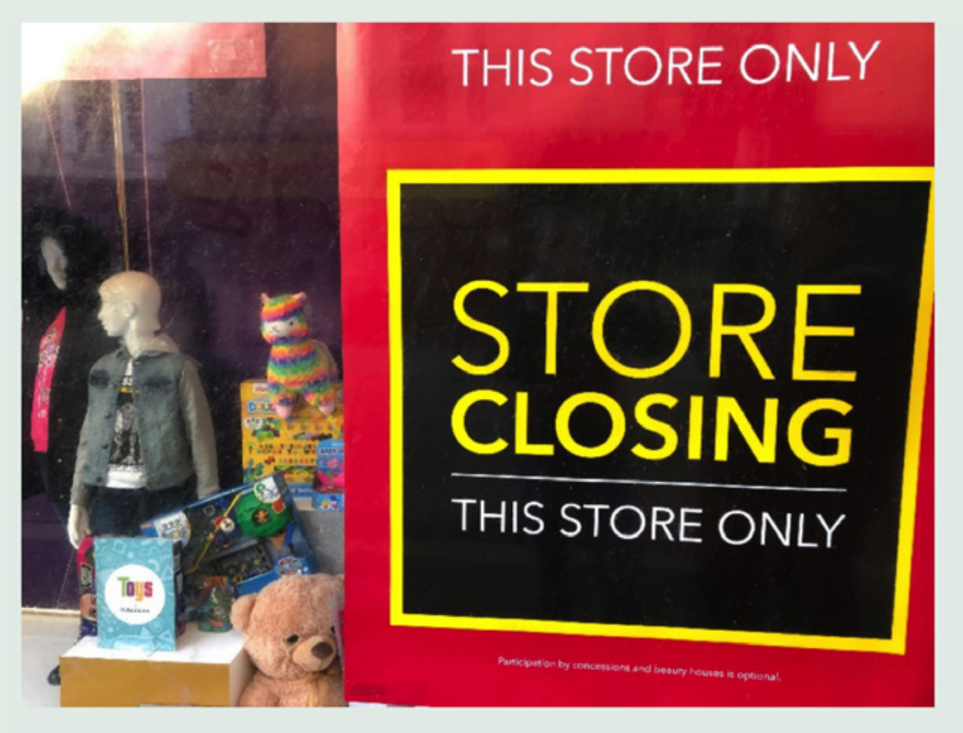
Debenhams' shop front sign, Hastings

FRP Advisory, the administrator of Debenhams, has confirmed most records of the company are held in a central store. Boohoo, the new owners of the Debenhams brand and intellectual property, will have an interest in records of Debenhams. The CMT await further details and opportunities to provide advice. Some branch records are already deposited and FRP Advisory are happy to sign off gifts of this material via the CMT. The rest of the records are being transferred by store managers to central storage. In both cases it's really good to see insolvency practitioners are engaging with the archive sector.