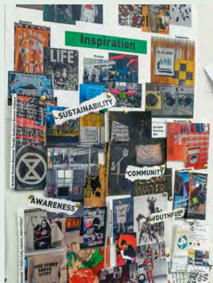
A communication campaign 'mood board' created by fashion design students from the Liverpool John Moores University

Working with the course leaders, we chose nine brands to focus on, and prior to the visit, shared some images and information about their historical background. In October 2019, we welcomed just over 50 students in their second year of a fashion design and communications course, (split into two groups, and still a tight squeeze). They toured the archive and visited the searchroom to look more closely at some of the archives. An agreed objective was the students needed some insight into licensing copyrighted materials, so we showed some examples from the collection, alongside original adverts and packaging to give an idea of the possibilities and explaining the 'how to' process. It was remarkable to see what the students picked up on, not just straightforward logos, but colours, fonts, the experience of using a product, the history behind a brand and its purpose. Eventually, many photographs and questions later, our visitors were on their way back to university – and we waited, with no idea of the outcome.