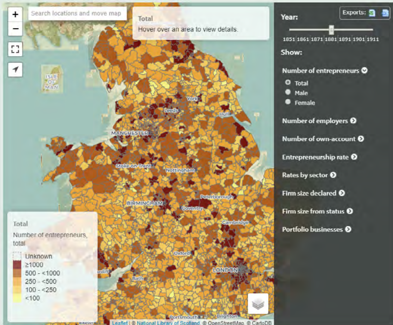
The Atlas of Entrepreneurship showing the total of all entrepreneurs by RSD in 1881

In April 2020, a new web-based resource, the British Business Census of Entrepreneurs (BBCE) , was launched, enabling business archives researchers, students and schools to look at the geography of employers and the self-employed as recorded in the censuses of England, Wales and Scotland for 1851-1911. This new database is accompanied by an Atlas of Entrepreneurship – a finding aid for users of the BBCE.