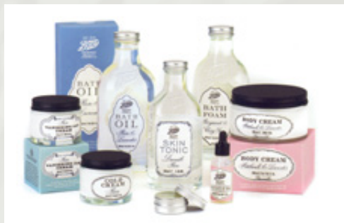
Boots Original Beauty Formula product range, 2009

“This range brings back to life the best of our amazing formulation and packaging archive, celebrating the tradition and history which makes Boots the great brand it is today.”