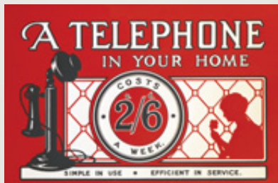
Telephone publicity poster, 1925

BT has a published Heritage Policy, a commitment to safeguard the heritage of the world’s oldest communications company. Its heritage programme encompasses BT Archives, which manages the company’s historical records, and the Connected Earth museum initiative, a museum partnership to showcase BT’s dispersed collection of historical artefacts linked to a website that draws exclusively on BT’s archives. This leadership in corporate responsibility also engages customers positively with the BT brand, differentiating BT from its competitors.