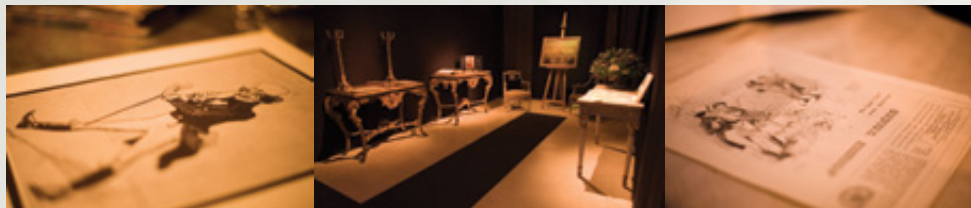
Archive materials on display at media product launch, October 2008

When Diageo launched a limited edition premium blend whisky, the marketing campaign focused on the product’s exclusivity and the Walker family’s unrivalled history and skill in blending. Documents, images and artefacts from the company’s archive were used to enhance internal stakeholders’ knowledge and awareness of the new brand. Archives were