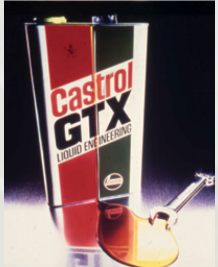
Castrol GTX advert, 1983

Castrol GTX is one of the best-known engine oil brands in the world, but with commercial success comes the threat of counterfeit. Where trademarks are infringed, the BP legal team is regularly called upon to prove that Castrol GTX has been continuously advertised and sold in particular territories. They do this by exploiting Castrol’s comprehensive archive of historical packaging, pricing and advertising material. Although the intellectual property in the archive is historical, material perceived as out-of-date is used as evidence of commercial development over time, and is invaluable for protecting current brands, and ultimately BP’s business.